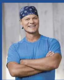
Yoga with Baron Baptiste