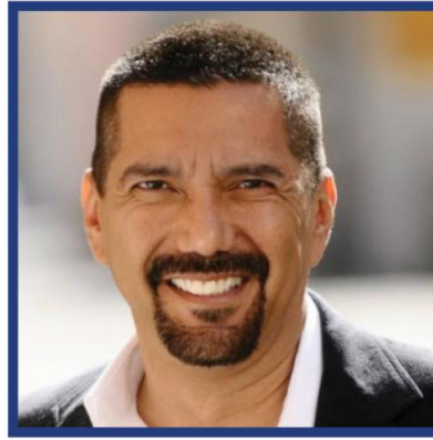
Steven Michael Quezada, Actor/Comedian