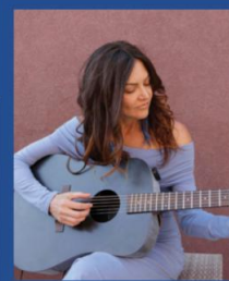
Singer/Songwriter Shannon Runyon